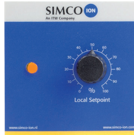
External control kit optional