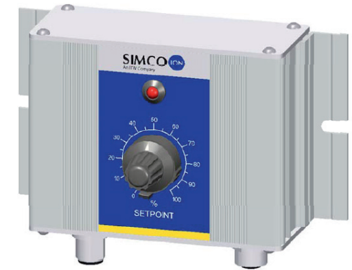
External control unit optional