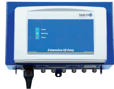
Easy cable acces