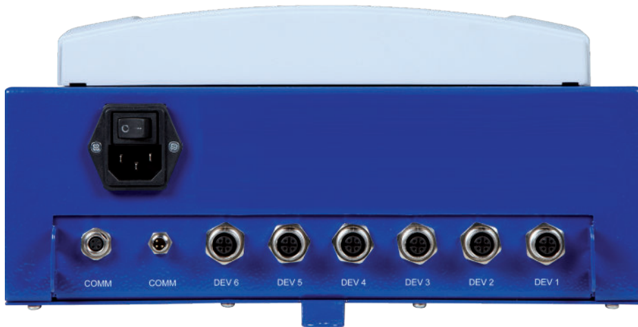
Connection of up to 6 devices