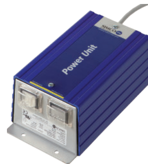
A2A7M Power Unit with 12V connection for the pressure sensor

An optional airpressure sensor can measure the air pressure inside the airknife. If the pressure drops under the required level, the system does not work optimal. A system check is then necessary, often it appears that the air filter needs to be cleaned.