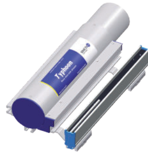
Typhoon with Performax IQ Easy anti-static bar