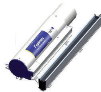
Typhoon with Performax (IQ) Easy Ex anti-static bar