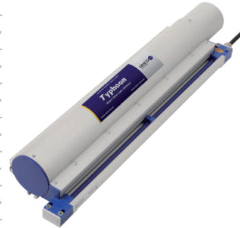
Typhoon with EP-Sh-N anti-static bar