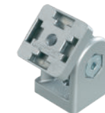
Optional mounting hinges for Typhoon airknife