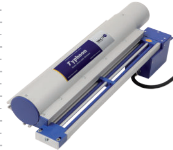
Typhoon with P-Sh-N-Ex anti-static bar