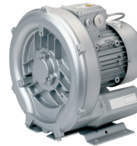
Powerfull but compact blower for the Typhoon airknife. Supplies filtered air to the airknife